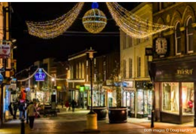
Both images © Doug Harding